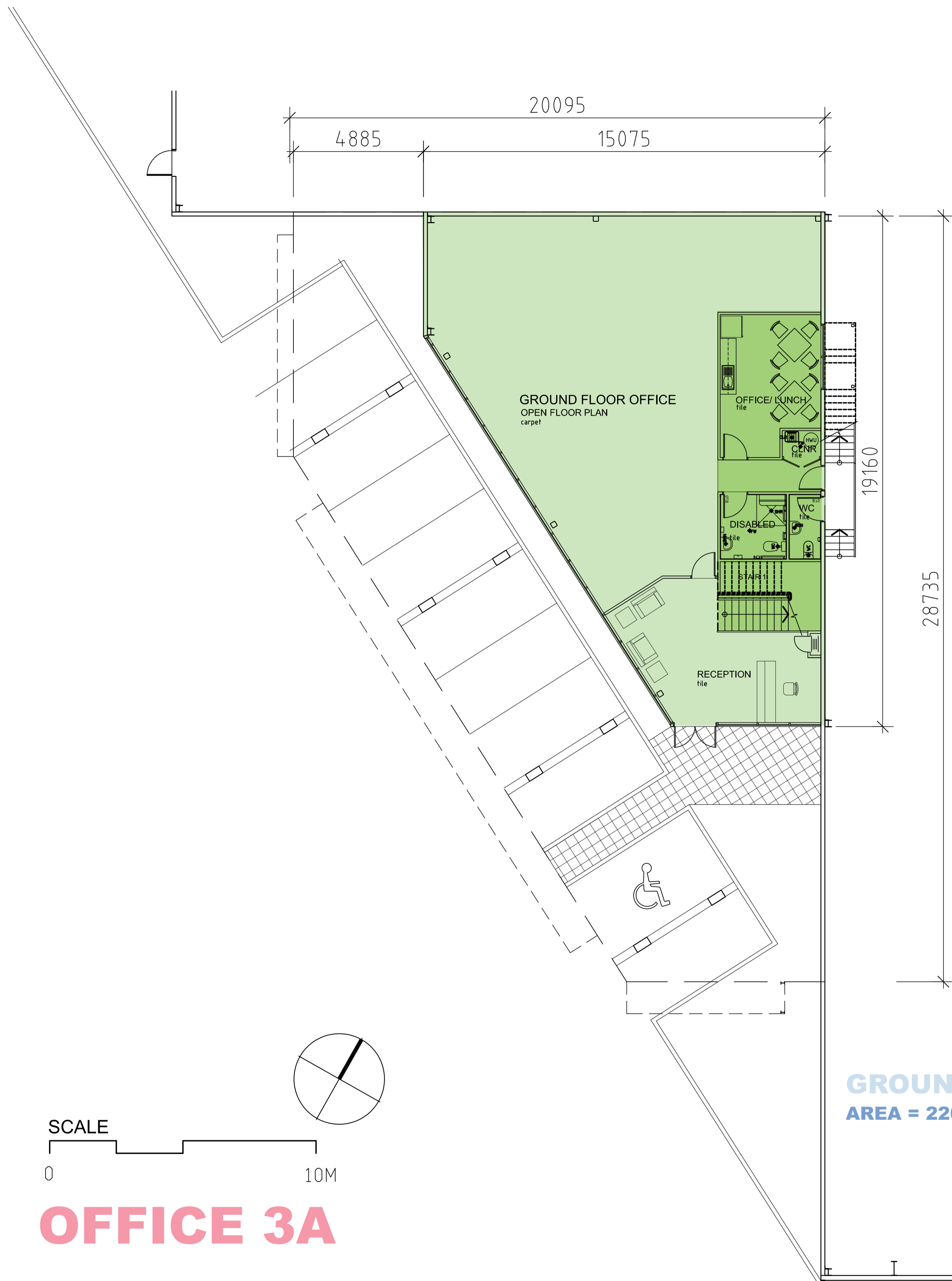
GROUND FLOOR PLAN AREA = 220 SQM